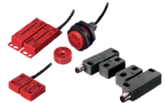
Contactless Safety switches