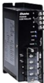
Thyristor Power Controller