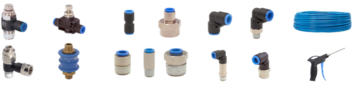
Air Line Valves