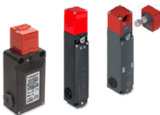
Safety Locking devices