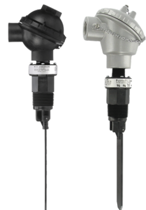
Air velocity Transmitters