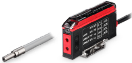
Fibre Optic sensors