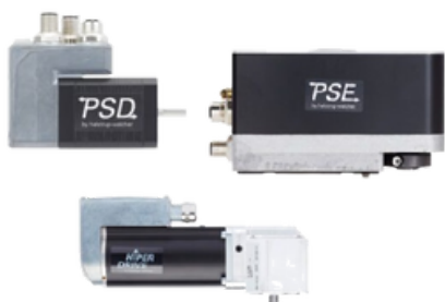
Smart Positioning Drives