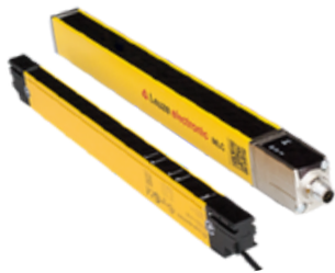
Safety Light curtains