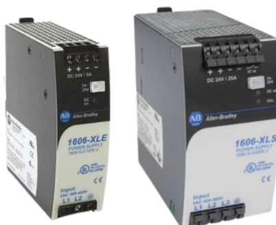
Power Supply units