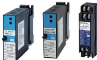
Signal Conditioner With Isolated Single / Dual Output (Isolater)