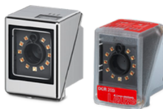
Camera-based code readers