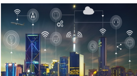
IoT / Smart City