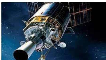
Aerospace & Defence