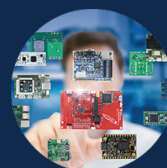
Development tool Center