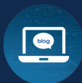
Blogs & Articles