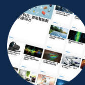
Tech Content Hub