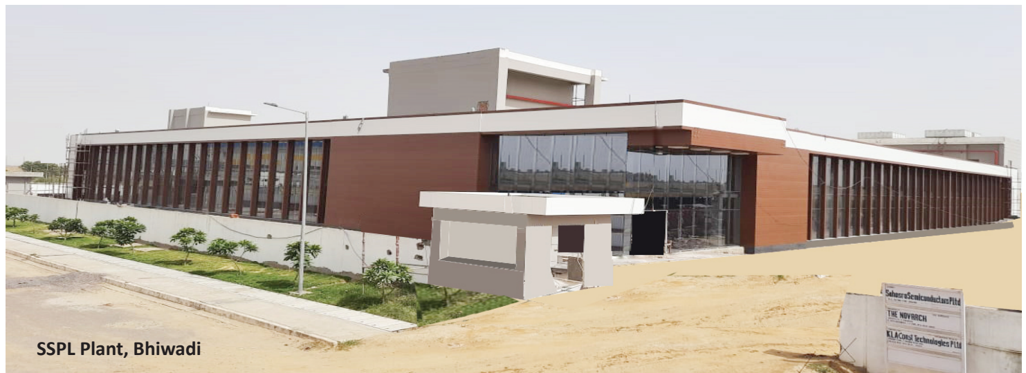
SSPL Plant, Bhiwadi