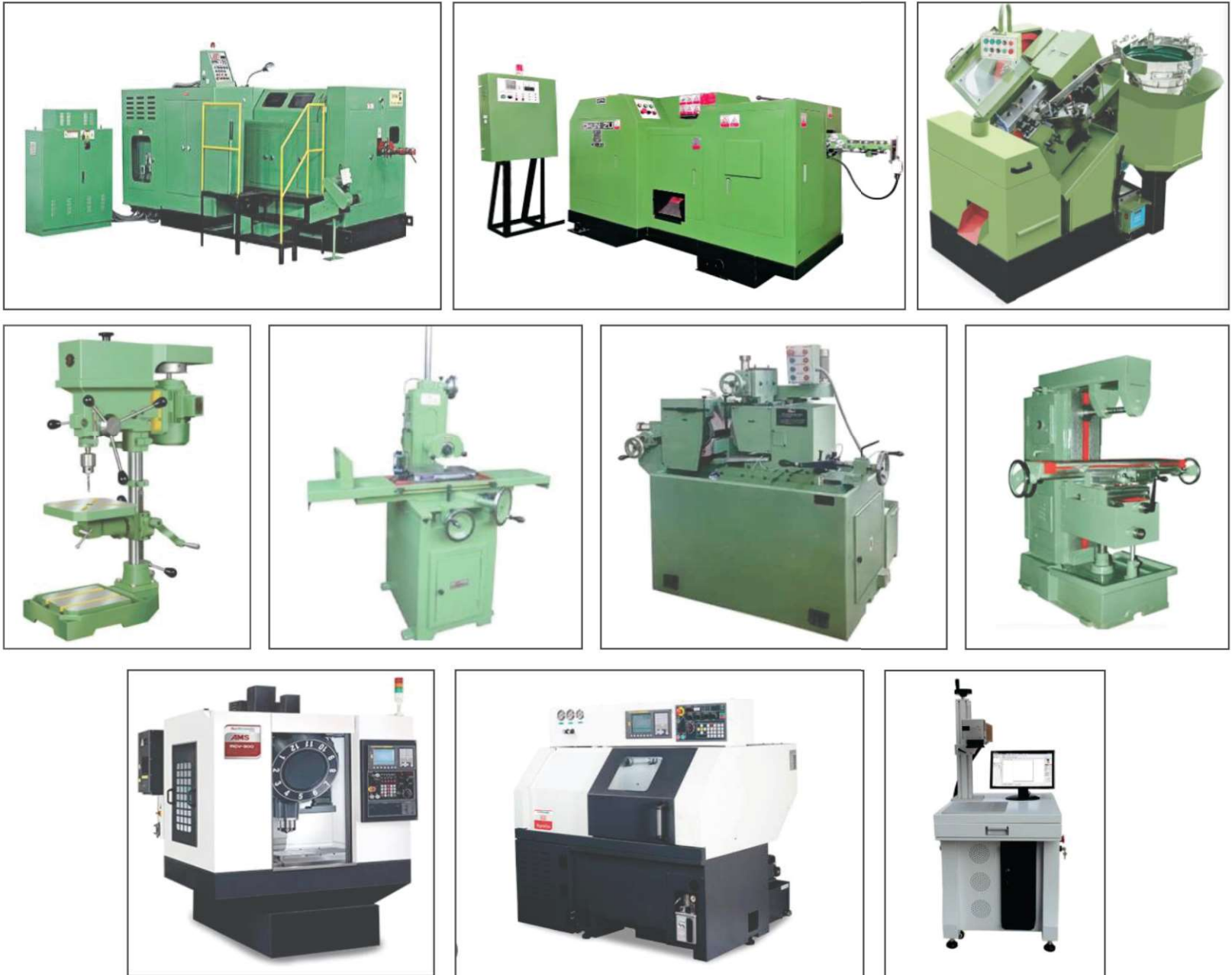
MULTI-STATION HIGH SPEED BOLT MAKER | HEADER | ROLLING MACHINES | DRILL MACHINES | SURFACE GRINDING MACHINE | CENTRELESS GRINDING MACHINE | MILLING MACHINES | CNC MACHINES | VMC MACHINE