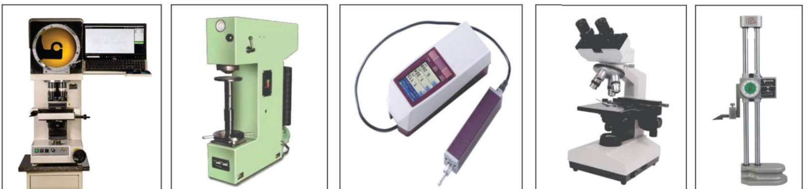
PROFILE PROJECTOR | HARDNESS TESTER | SURFACE TESTER | MICROSCOPE | HEIGHT GAUGE