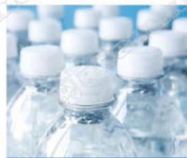
Materials handling industry