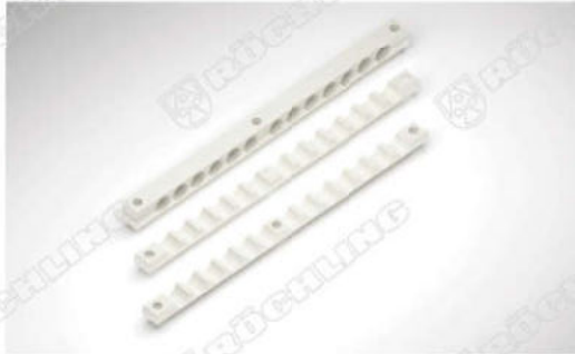
Cable clamps for rail vehicles made from SUSTAMID 6 FR: the new flame-resistant material allows extruded PA 6 to be used in areas with high demands on flammability.

In areas making high demands on fire behaviour – such as transport and the electrical industry – manufacturers of plant and machinery often had to get along without the unbeatable PA 6 as a machine construction element and so missed out on its outstanding mechanical properties as well.