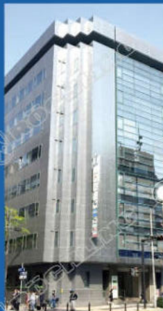
Röchling Engineering Plastics Japan Co., Ltd