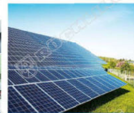
Electronics & solar power