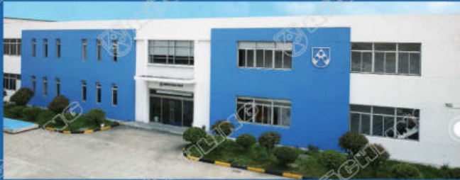
Röchling Engineering Plastics (Suzhou) Co., Ltd