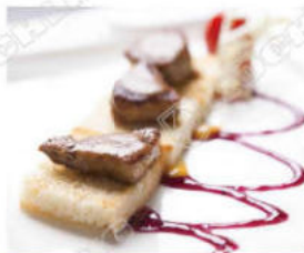
Food processing industry