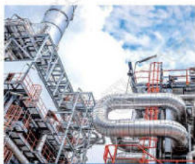
Chemical engineering and environment