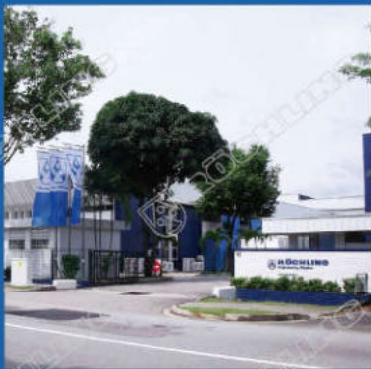
Röchling Engineering Plastics Pte Ltd