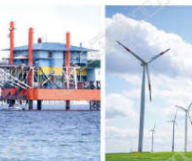
Oil and gas industry