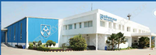
Röchling Engineering Plastics (India) Pvt. Ltd.