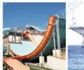
Sports and leisure industry