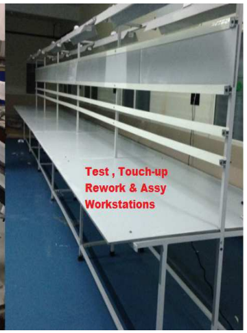
Test, Touch-up Rework & Assy Workstations