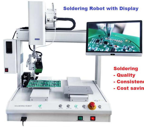
Soldering Robot with Display