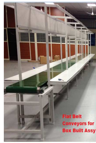
Flat Belt Conveyors for Box Built Assy