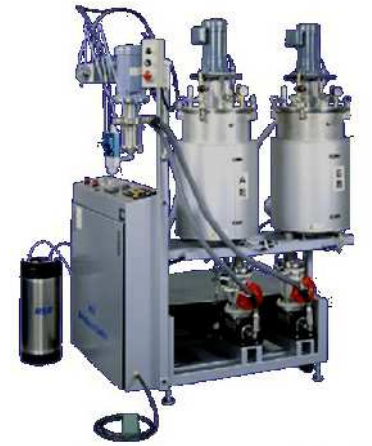
Two Component metering & Dispensing / Potting M/c